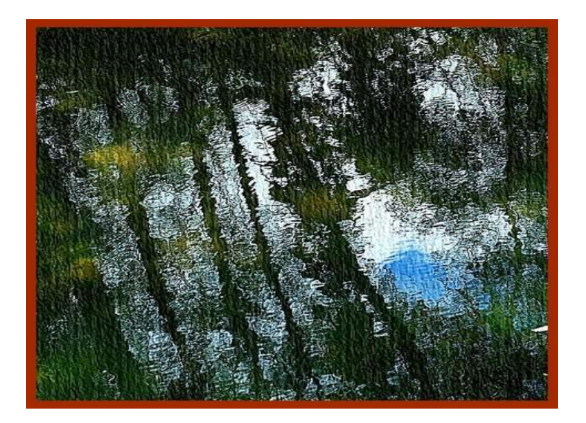
APRIL— The Makings of Self and Non-self Freedom

Living in a changing and imperfect world, already half the answer is known—life is impermanent, dissatisfying and subject to suffering. The Five Remembrances affirm life as it is: there is sickness, aging, death, loss of loved ones and possessions, all directed by actions leaving one unfulfilled. Now what does this imply about you as a person? The insight into non-self is challenging because of the mistaken notions and strong attachment one has as self-identification.