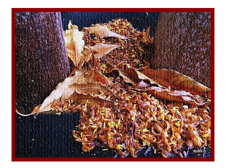
MARCH— The Impermanence of Life-Actions

Insight Meditation and the Middle Way are a personal experience and realization to know life, the world and reality as they are—impermanent, dissatisfying and subject to suffering, and of a non-self, impersonal nature underscored by purposeful action.